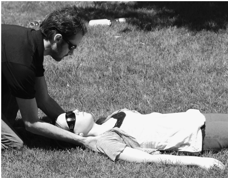
Figure 1. (A, B) Demonstration of trap-squeeze technique for manual cervical spine stabilization.

muscle) and firmly squeezes the head between the forearms with the forearms placed approximately at the level of the ears (Figure 1). The trap squeeze was superior to the head squeeze in this study, particularly with simulation of an agitated patient.