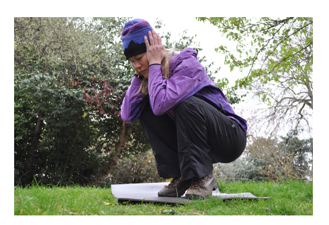
Figure 3. Lightning position.