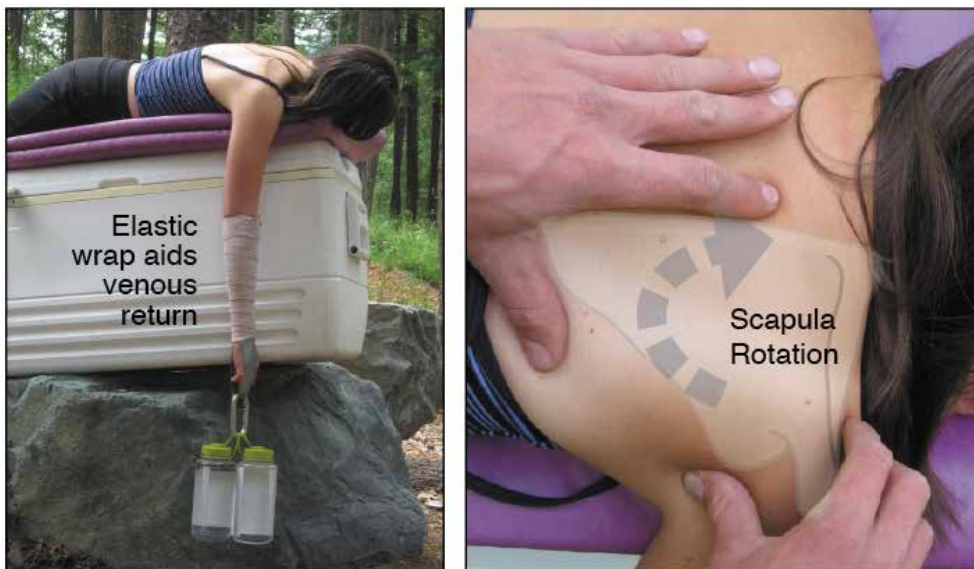
“Hanging traction” method ( \pm scapula rotation) for reducing an uncomplicated anterior shoulder dislocation.